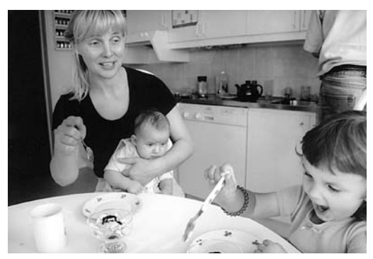
Figure 48. Family is important, according to inhabitants of all Baltic countries. The meaning of family is, however, culture specific and slightly different in each country.

(cf. above on this aspect). The reason is simply that the questions in the EVS/ WVS questionnaire on national pride and national belonging, which might be considered for this purpose, did not give easily comparable data for the various Baltic countries. This is a good illustration of the fact that the data from the EVS/WVS project meet considerable methodological problems, for instance with regard to the degree of comparability of data from different countries. With regard to the Baltic region, it is therefore important to ask whether or not the data from such differing countries as Russia, Germany, and Sweden can be meaningfully compared.