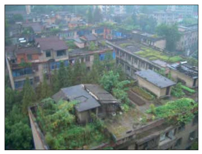
Figure 9.6 Green buildings in Tongyang South Korean

Stormwater management . Green roofs absorb and retain rainwater and can be used to manage stormwater run-off in urban environments. They can also filter particulates and pollutants. Stormwater run-off can be reduced or slowed because it is stored in the substrate, used by or stored in the foliage, stems and roots of