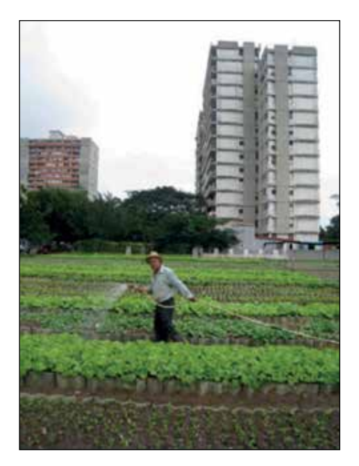
Figure 9.10. Cultivation in the new fringe zone. In many suburban areas there is a direct contact with forests, fields and water and yet there is very little attempts to make use of the production values and other values related to urban farming. In this example large green areas have been transformed into productive land.

and human cultures on the one hand and glades, meadows, forests, parks, arable fields, lakes, seas and rivers on the other. Throughout the history of civilization, edges between town and nature have proved to be the most preferred locations for habitation. For citylands the edge line is expanded to a wider zone: in this zone will be the important district green areas for neighbourhood recreation (district parks, play grounds, sports grounds, orchards, stables for sheep, cows, horses and pigs); in this zone there could be room for urban agriculture with green houses and community gardens, where fruit and vegetables can be grown for urban and sub-urban dwellers; in this zone there is room for clean companies and clean micro-production; in this zone there is land for industrial combines, refining the primary produce into food, fuel, fibre, boards and other building material; in this zone there is room for new recycling of waste industry; and in this zone there is room for the new generations or renewable energy (wind and wave power, Photovoltaics and solar heat collectors and bioenergy cultivations) and energy carriers (storage of bioenergy and electricity).