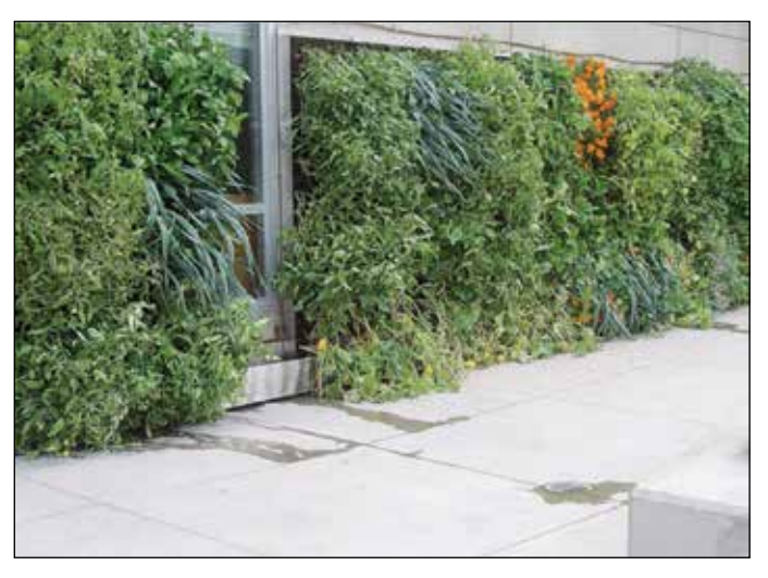
Figure 9.9 Growing Tomatoes, Leeks, Strawberries, Cucumbers and more on a wall for the Los Angeles Food Bank, USA.