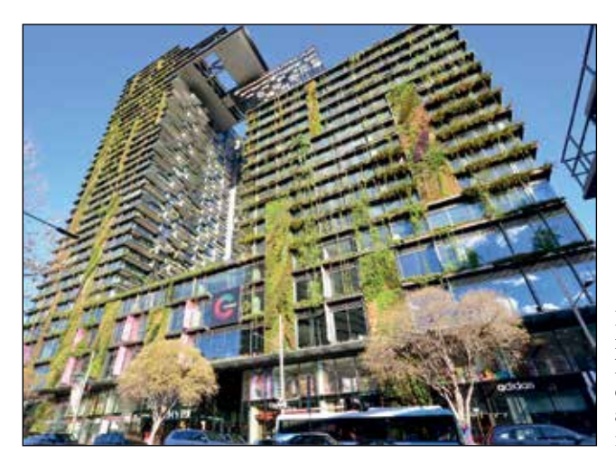
Figure 9.5 Green facades in Sydney Australia

of less than 200 mm deep, requiring minimal maintenance. They generally have lower water requirements and use small, low-growing plant species, particularly succulents. 'Ecoroofs' or 'brown roofs' are terms used to describe these extensive green roofs. Roofs that are designed and planted specifically to increase local plant diversity and provide habitat (food and shelter) for wildlife are known as 'biodiverse green roofs'.