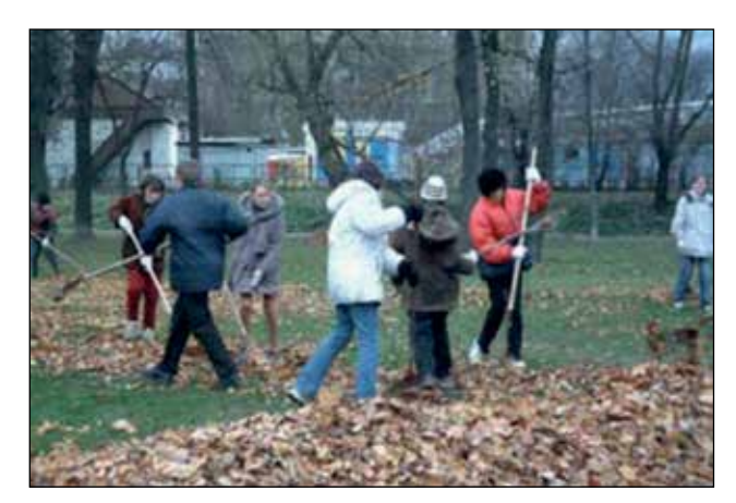
Figure 9.4. Subbotnik, a public cleaning day in Tavrichesky Garden, organized during a Danish project (Photo, Cecil Konijnendijk).

ingrad wetlands. Each micro-district could house 6,000-15,000 people. Not all micro-districts were built according to the plan, leaving open space and vacant lots between the houses, designated as pustyr (literally vacant lot or non-built up space). In some cases the vacant lots have been invaded by nature and turned into wild areas and the local residents use the space for recreation. Together with the large backyards between the houses the vacant lots comprise a significant share of the urban green resource.