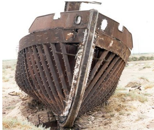
Rusting hull of ship in Uzbekistan.

Equity and ethical concerns also center on intergenerational issues. To what extent should land and water resources be exploited by the present generation of users, if its use impinges in a negative way on the ability of future generations to maintain their livelihoods? To what extent does the concept of "sustainable development" play in the decision making processes of current leaders in the region? Aside from the human issues of equity, one can ask "Who speaks on behalf of Nature?" Who represents the interests of the sea, the fish, the soils, the rivers, the deltas? It is now clear that the cotton-related Aral Basin development policies were going to destroy the Aral Sea's natural environment and ultimately its productive capabilities.