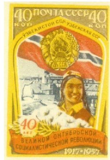
Uzbek stamp from 1957, highlighting the importance of cotton

Little, if any, political attention was paid, however, to the environmental costs associated with the long term environmental and societal consequences of cotton production. Quotas set in Moscow drove regional political leaders and collective farm managers to push hard on the workers to meet the unrealistic quotas, quotas that were often met only on paper. There are many documented accounts about how the cotton production statistics were manipulated to please the Politburo thousands of kilometers away from Central Asia.