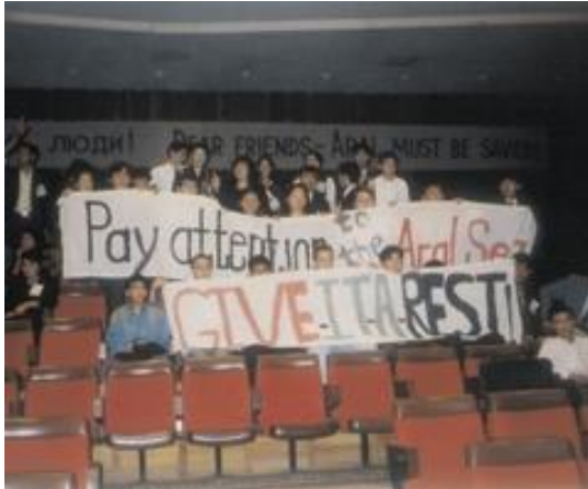
Student demonstration to “Save the Aral Sea” in Nukus, 1995.

political and humanitarian will to do so were there, the regional economies are linked so strongly to the production of cotton that water would have to be found elsewhere to “save the seas”. However, it would be possible to refill and stabilize it at an intermediary level by letting predetermined amounts of Amudarya streamflow to reach the sea each year for the next several decades. Restoring both seas would help to improve the living conditions in the pre-Aral region and would help to improve regional human as well as ecological health. In addition, a partially restored Big Aral would serve as an example of how creeping (seemingly insignificant but cumulative) local and regional environmental changes can lead to major national catastrophes in a relatively short period of time.