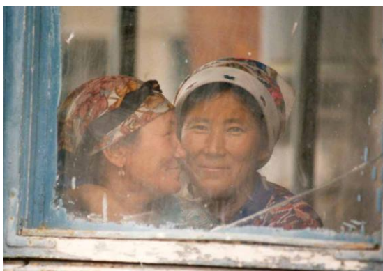
Workers pondering their future in a dying industry in Nukus, Uzbekistan, 1995.

Society's impacts on the Aral have for the most part been negative. Increasing streamflow diversions over the past five decades have led to a sharp and relatively rapid decline not only in level, but also in societal and ecological well-being. The diversion from the Karakum Canal has contributed to that decline. The drying out of the deltas has caused a loss in wetlands, an increase in salinity, a decrease in biodiversity and an attendant loss in revenue and the destruction of various economic activities dependent on delta habitats for flora and fauna. As the sea's coastline shrunk fishing ports and their supporting settlements moved farther from the sea. The image the world has of this drying sea is conveyed in photos of fishing vessels trapped by desert sands, destined to rust away or to have their metal parts salvaged.