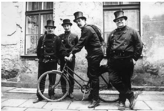
Figure 155. Transformation of the economy endangers some traditional professions. Modern heating systems do not need as much service as the traditional, coal-based systems. Polish chimney-sweeps, in 2001.

Of the Baltic Sea Region countries, Belarus and Sweden display the lowest rates of registered unemployment (see tab. 37).