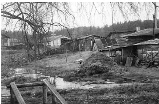
Figure 158. Former kolkhoz in Zalavas, Lithuania.

This chapter will focus on the main structural changes in the labor market, on employment and unemployment. (Some definitions and explanations on labor market will be found in inserts here, others can be found in chapter 52 by Susanne Oxenstierna.)