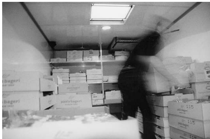
Figure 154. At work.

The growth in the labor force as well as the increase of women in the labor market – though starting from