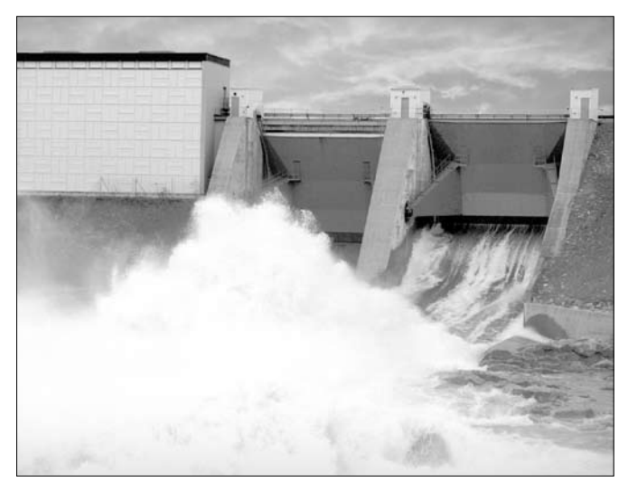
Figure 3.4 Hydropower provides 50% of the electricity in Sweden. Porjus hydropower station is the largest in Sweden. The environmental costs of hydropower are mainly related to the large infrastructure requirements, especially upstream reservoirs.

The development in the power sector is much discussed since the political incentives to reduce fossils to curb the car-