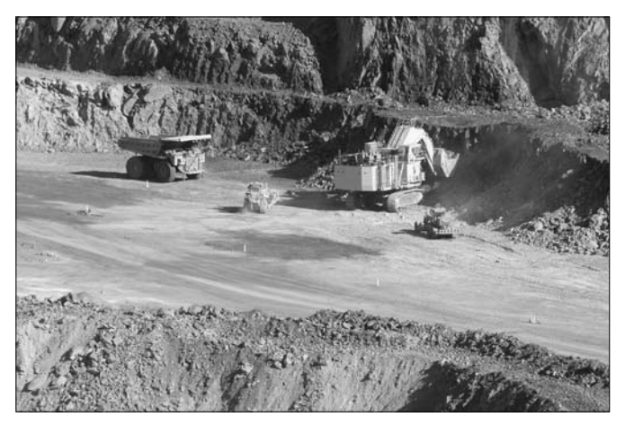
Figure 3.5 Iron and metal mining. Heavy equipment digs and hauls ore inside an enormus open pit mine.

bon dioxide emissions are increasing. In Finland a decision was recently taken to build one more nuclear power plant, while Sweden has recently closed one plant (Barsebäck). Ignalina in Lithuania, one of the largest nuclear power plants, will be closed in 2009 as part of the EU accession agreements. Waste incineration is increasing, and district heating is built in many cities. Wind power is becoming important in many countries, and is already so in Denmark and Northern Germany.