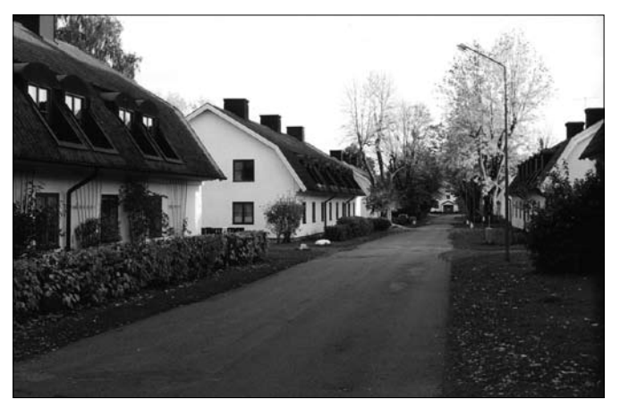
Figure 3.1 A renovated traditional industrial environment in the small town of Gimo in Uppland about 100 km north of Stockholm. For a hundred years iron production was the almost exclusive industry in Gimo. The owners lived in the mansion and all workers lived in these houses along a central street, called "bygatan." Gimo is still a lively town. Industry there has been transformed several times and is now producing high quality steel products for special purposes. The old houses for workers have been renovated and are again popular, although many of their inhabitants commute to the city of Uppsala.

Fishing in the Baltic Sea was at its peak in the early and mid 1980s with total catches of close to one million tonnes