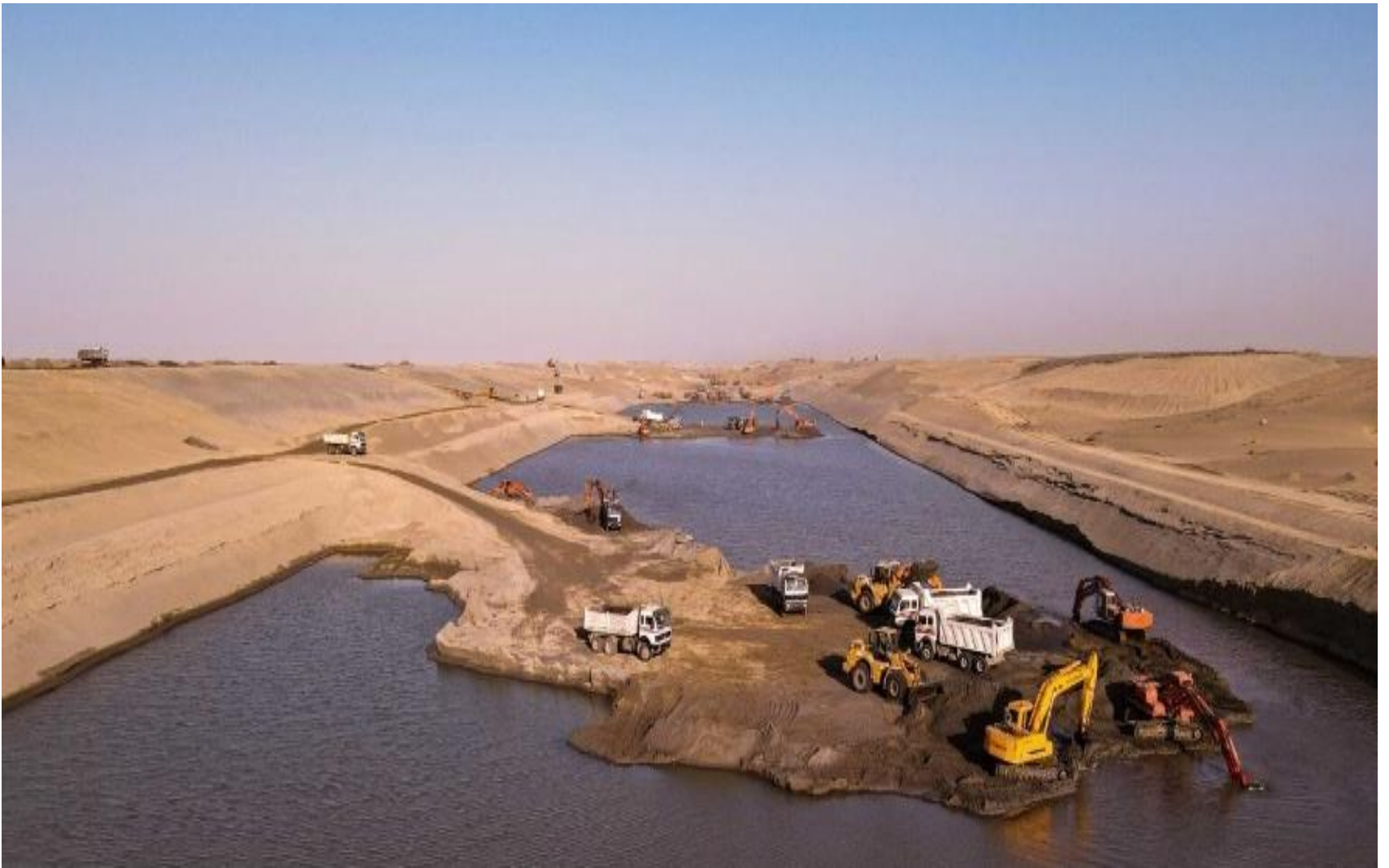
Qush Tepa Canal